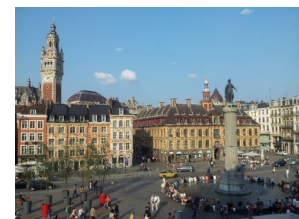
Lille 'Place Général de Gaulle'

90 minutes from London 60 minutes from Paris 45 minutes from Brussels