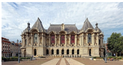
Palais des Beaux Arts

Lille, capital of the French Flanders, is located in the northernmost part of France. It is very convenient to travel to one of the major international airports in Paris (France), Brussels (Belgium), or London (UK). High speed train connections are regular and very practical, with very short travel times to Lille. Hotels and restaurants are available in all price categories, mostly in walking distance from the metro and train stations.