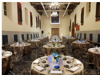
Salle des Hospices