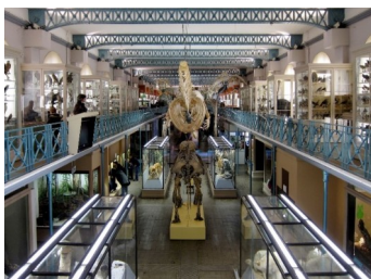
Musée d'Histoire Naturelle

The conference dinner will be organized on Wednesday, July 12 th , at the Hermitage Gantois, an ancient hospice (a former charitable almshouse) of the late 15 th Century, located in the city centre of Lille, in walking distance from the railway station. The reception and dinner will take place in the “Salle des Hospices” the historical main caring room.