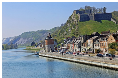
Devonian type section of Givet, Meuse Valley

Congress Website: https://strati2023.sciencesconf.org