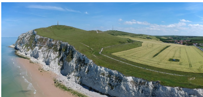
Cretaceous cliffs of the Cap Blanc Nez – Côte d'Opale

(pre-conference excursion of the International Symposium of the Ordovician System in Tallinn, Estonia)